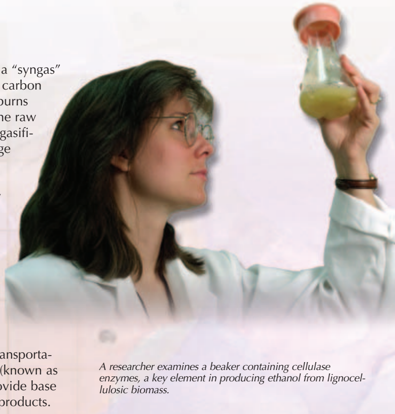
A researcher examines a beaker containing cellulase enzymes, a key element in producing ethanol from lignocellulosic biomass.

At the McNeil Biomass Power Generating Station in Burlington, Vermont, NREL researchers helped design and install an R&D 100 Award-winning gasification system. The project is one of two major DOE projects to develop technology to dramatically improve the efficiency and air emissions quality of biomass power systems. The McNeil Station already is successfully burning up to 200 tons per day of gasified wood chips in its normal steam generator. Once the gas is hooked up to a planned gas turbine, efficiency should be double that of a combustion-boiler generation system.